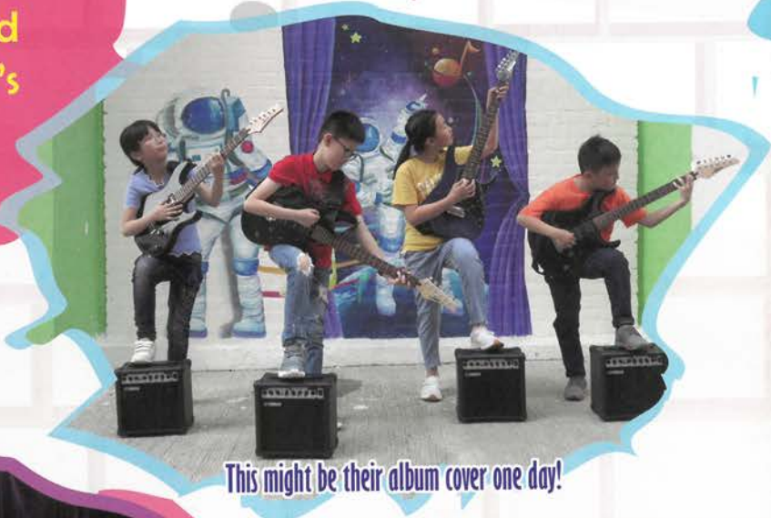
This might be their album cover one day!