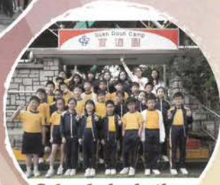
School picnic time