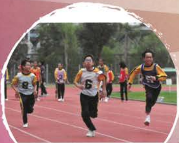
Racing to the finish Line