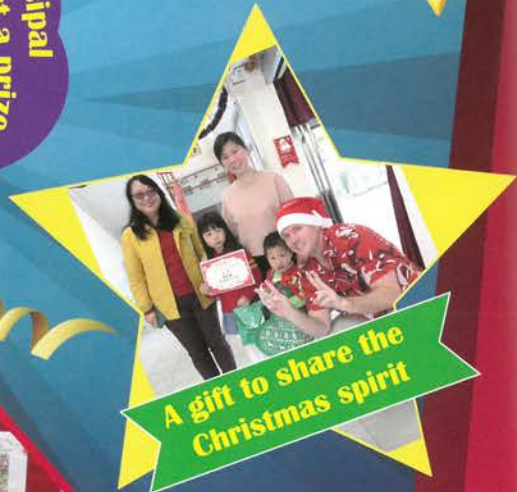
A few lucky winners