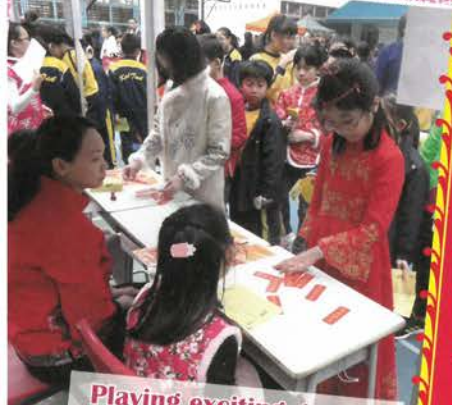
Playing exciting games

We've been having so much fun with our activities this year. At Chinese New Year we all got dressed up in our gorgeous traditional outfits and had so much fun at the game booths.