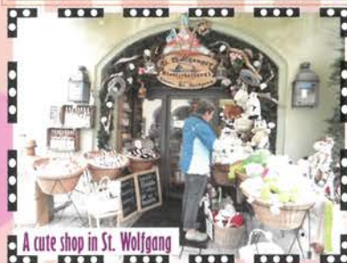
A cute shop in St. Wolfgang