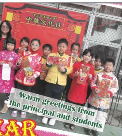
Warm greetings from the principal and students