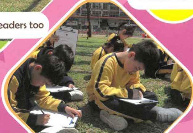
The gentle breeze and soft sunlight are perfect study partners