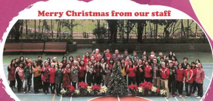
Merry Christmas from our staff

Our school life is packed full of adventure. Take for instance our fun-filled school picnics; our getaway travels to mainland China for the exchange programme; our super-fun Sports Day where parents and teachers race with our students; plus: camping trips; science trips; Caroling at kindergartens and elderly centres; I.T. learning activities, just to name a few. School life really is fruitful!