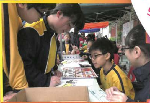
Using money to master math skills

For Maths day we did our best to calculate our way to awesome prizes. Students were so keen to get the correct answer by adding, subtracting, dividing and multiplying. See the smiling faces for yourself: