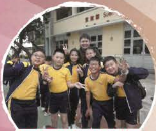
Look at these smiles