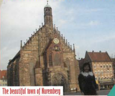
The beautiful town of Nuremberg