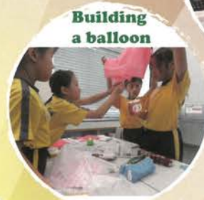
Building a balloon