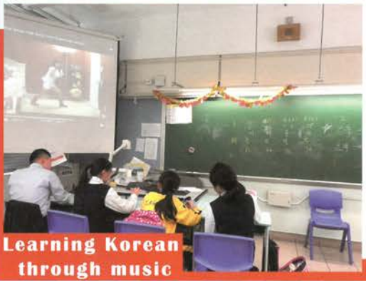
Learning Korean through music

Are you fascinated by K-pop music? Are you obsessed with Korean drama? Are you longing for a trip to Korea or even making a few Korean friends? Our Korean class is definitely what you are looking for! This year, a Korean Class was newly introduced to our students. With a lot of passion and hard work, students are learning how to read and write Hangul (basic Korean characters) and make simple conversation in Korean. They also get to know the history and culture of Korea by learning the language. Let's learn some common expressions together!