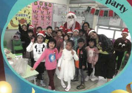
Santa joined the party