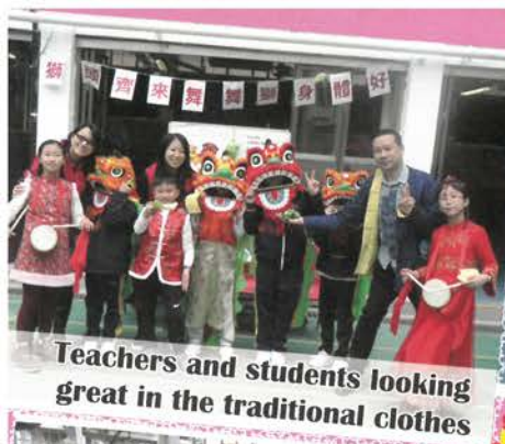
Teachers and students looking great in the traditional clothes

Our principal and teachers wishing you a happy Chinese New Year