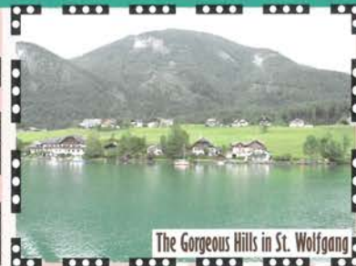
The Gorgeous Hills in St. Wolfgang