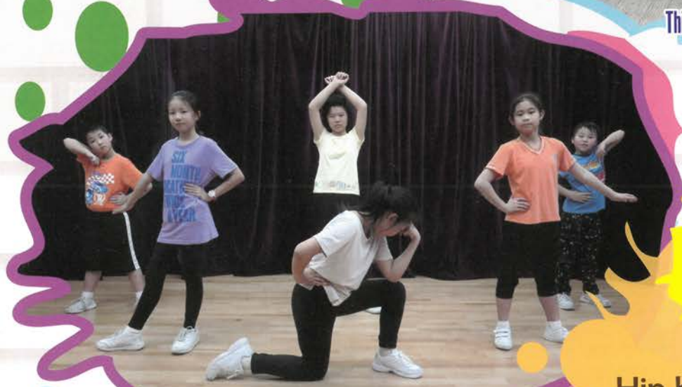
The KT hip hop troupe