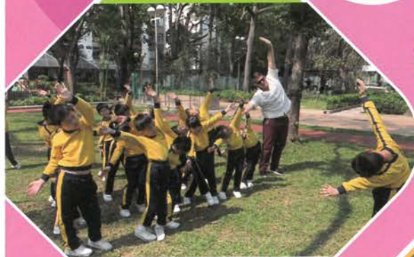
Our students are leaders too