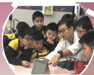
Science is fun