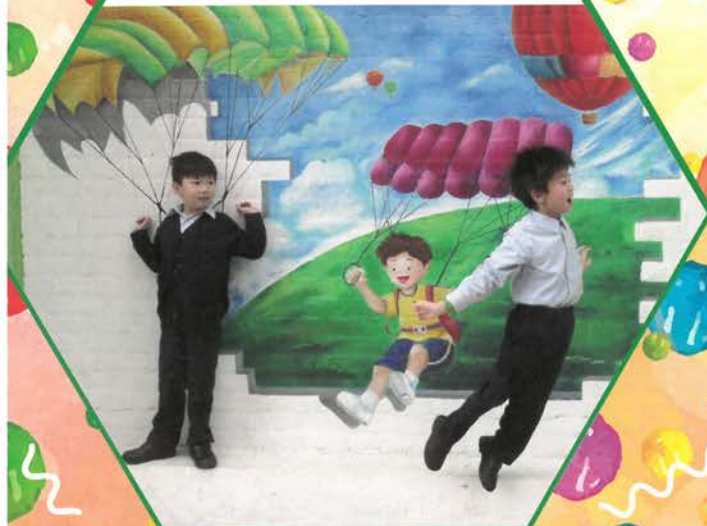
Up, up and away!