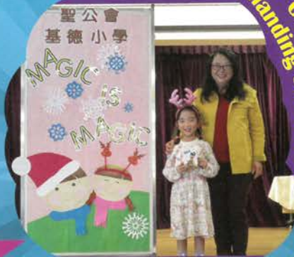
Our principal handing out a prize