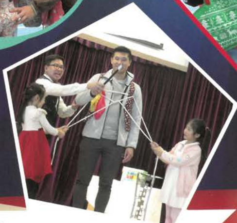
Dads got in on the act