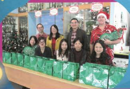
Welcome and Merry Christmas