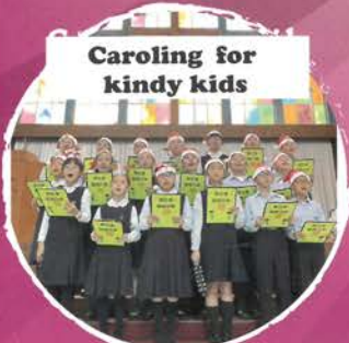
Caroling for kindy kids