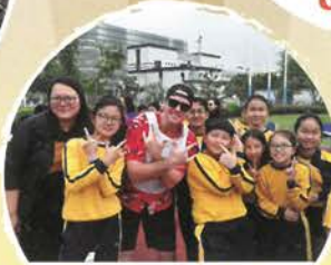
Getting ready for the relay