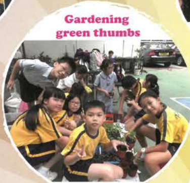
Gardening green thumbs