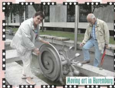
Moving art in Huremburg