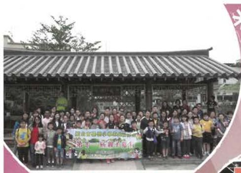
Picnic with PTA