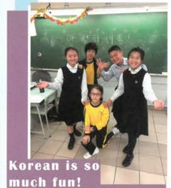
Korean is so much fun!