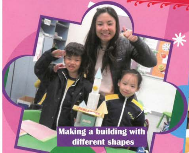
Making a building with different shapes