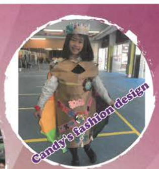
Candy's Fashion design