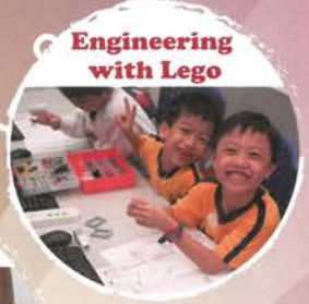
Engineering with Lego