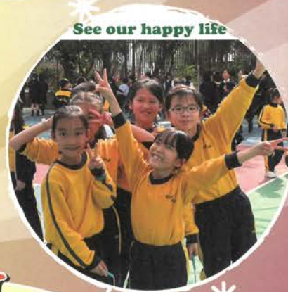
See our happy life