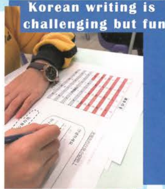
Korean writing is challenging but fun