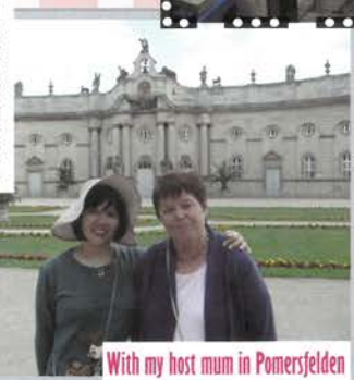
With my host mum in Pomersfelden