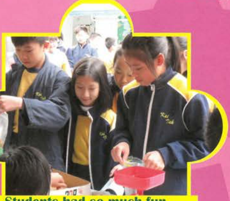
Students had so much fun at the game booths

We integrated technology into our Maths Day