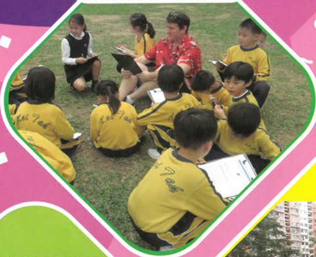
Time to chill out and finish our work