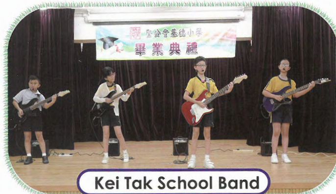
Kei Tak School Band