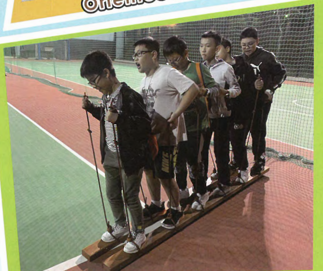
Walking hard together

General Studies Day encourages our students to explore the world around them and solve problems they may encounter in everyday life.