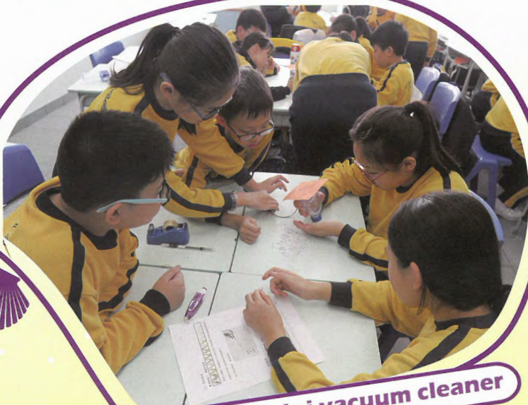
Making a mini vacuum cleaner