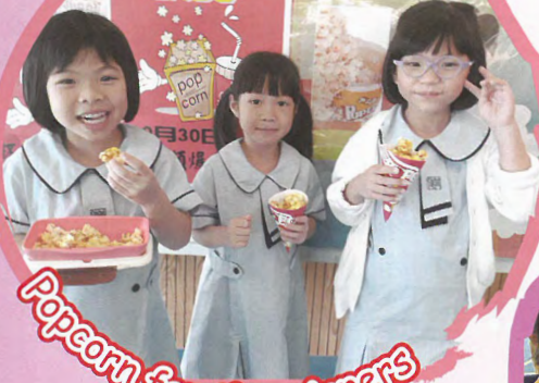
Popcorn for the winners