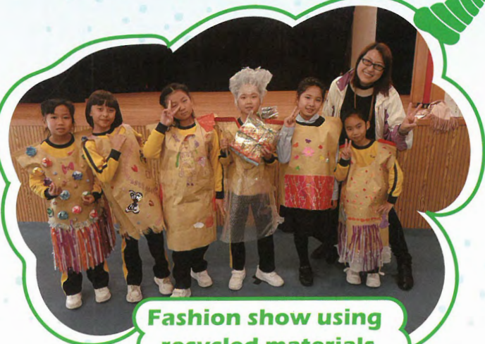
Fashion show using recycled materials