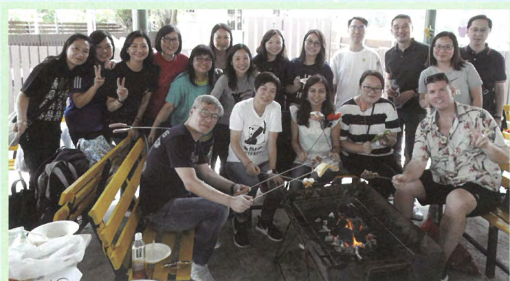
Teachers cooking up a storm