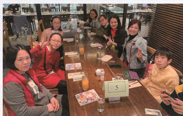
Drinks before lunch