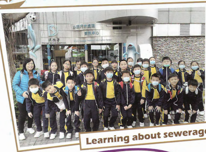
Learning about sewerage