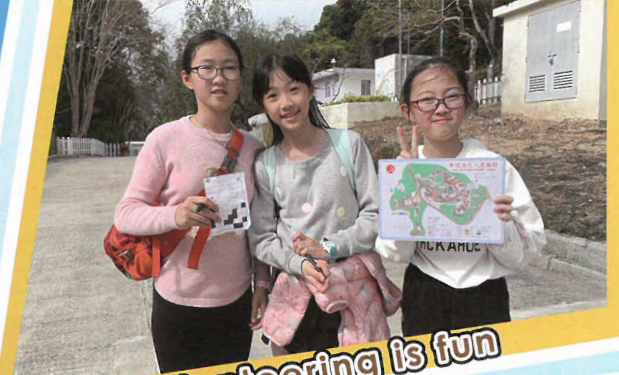
Orienteering is fun