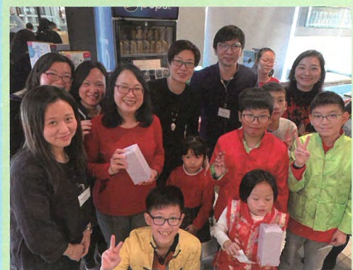
All smiles in our Traditional Chinese clothes