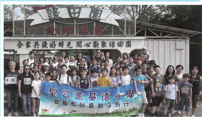
The BBQ Team