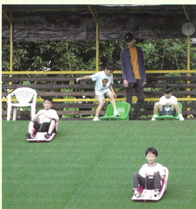
Racing to the bottom