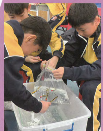
STEM learning about pressure