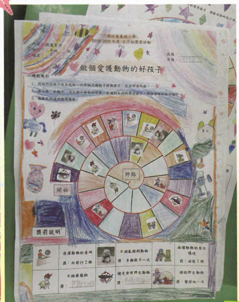
We love all living creatures