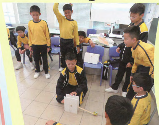
Exploring the world of Science