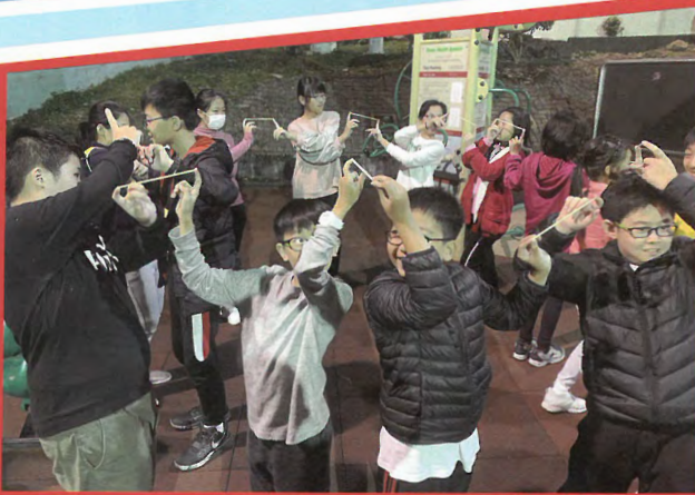
Team building life skills