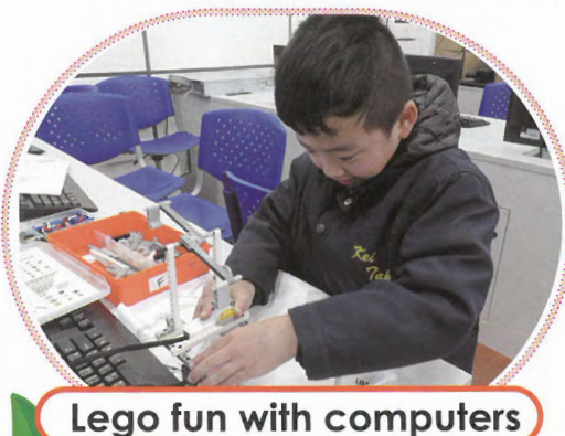
Lego fun with computers