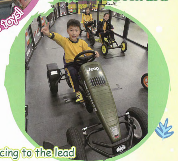
Racing to the lead