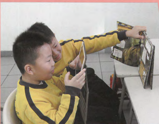
Reading with technology