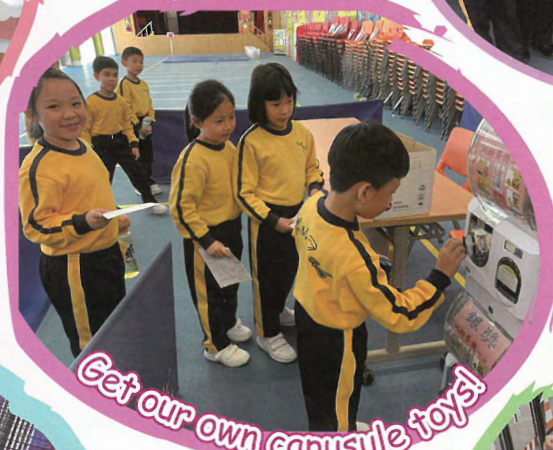
Get our own capsule toys!