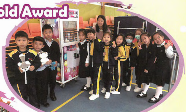
First time to use an UFO catcher!