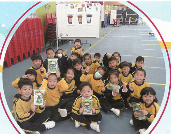
Reduce Reuse Recycle

The theme of the life-wide learning programme was environmental protection. During this week, our students were exposed to many different subjects, crisscrossing and overlapping so that the learning experience could be enhanced. It was so much fun!