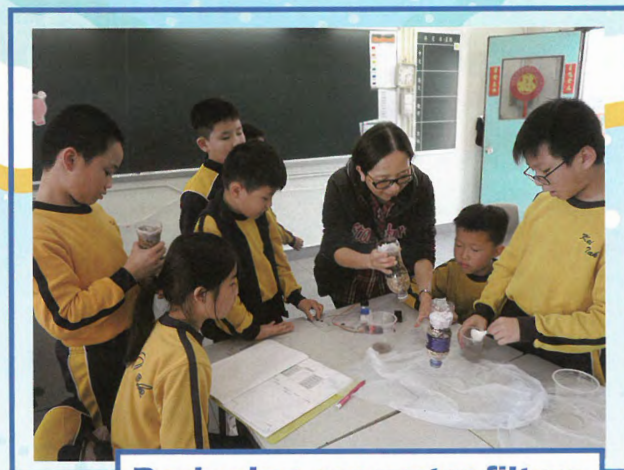
Designing our water filters