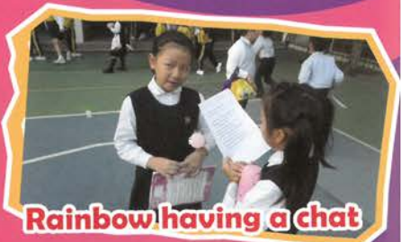
Rainbow having a chat