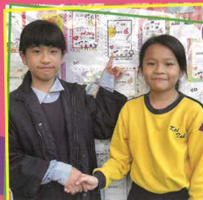
Praise cards board

Thank you! It's my pleasure to help the teachers!