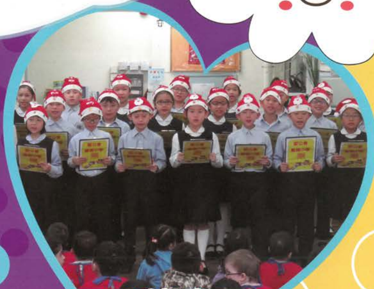
Christmas Caroling fun