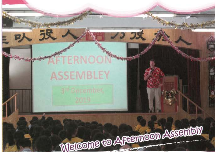
Welcome to Afternoon Assembly

Every Tuesday we hold an English Assembly. This year's theme is 'Thanksgiving'. Our students learn about and discuss what there is in this wonderful world to be thankful for!