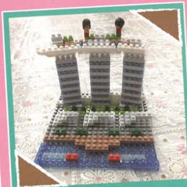
My LEGO model