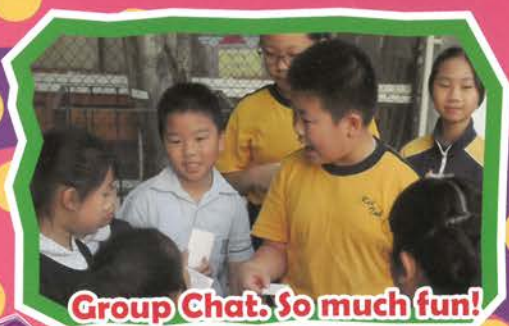
Group Chat. So much fun!