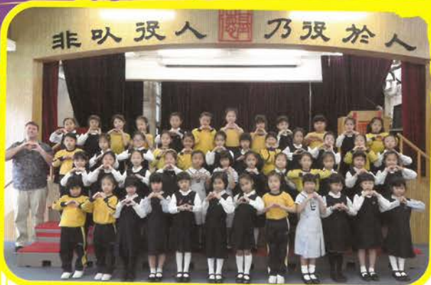
Getting ready for the performance

Hand-picked girls from P1 to P3 trained their hearts out for the Speech Festival. It was a really tough competition but our girls came out with a Merit and excellent comments from the judge.