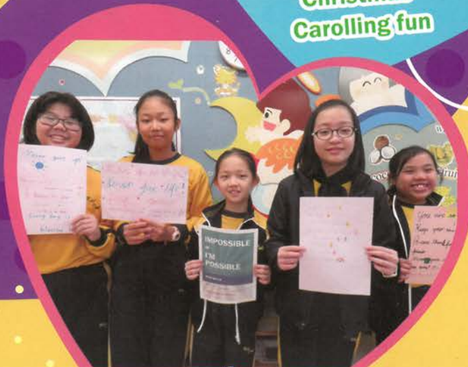
Phrases of Thanksgiving