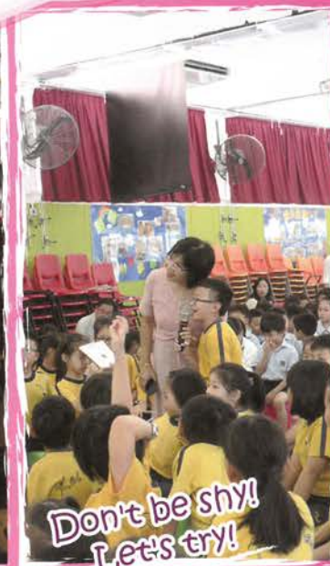
Don't be shy! Let's try!