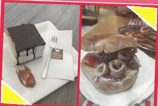
Yummy! I like eating!