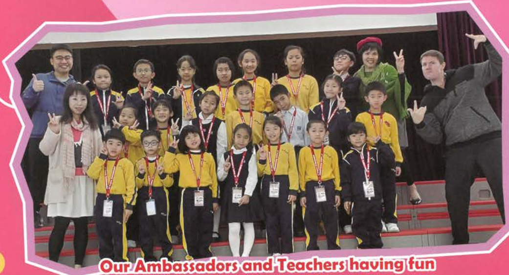
Our Ambassadors and Teachers having fun