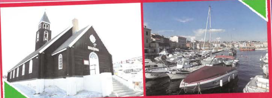
I like travelling!