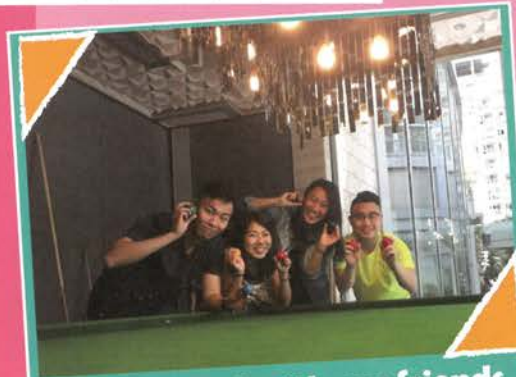
Playing pool with my friends