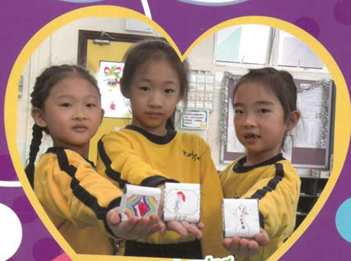
Students showing off their creative works