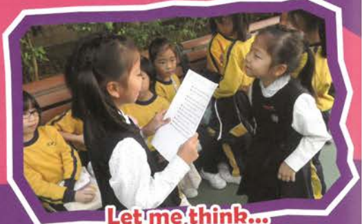
Let me think...