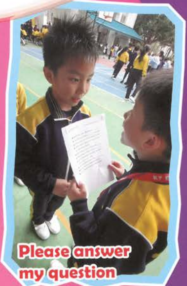
Please answer my question